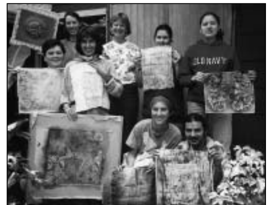
The Workshop group.

For info on Monteverde or the Studios of the Arts see www.monteverdeinfo.com , www.msastudios.com or contact Betsy at betsysterling@cs.com .