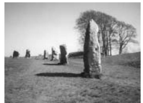
Standing stones at Avebury, England.

The ideas I encountered are just beginning to unfold in my memory, and the images I encountered will keep me supplied for years. It is so important to see the work of other artists in other cultures. The real reward of travel is to see how the lives and environment of other people are affected by the secret assumptions in the subconscious of the culture.