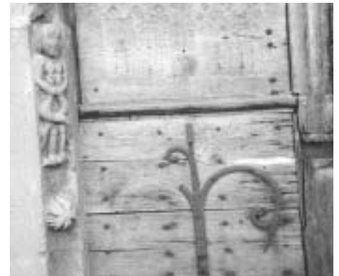
Door at Romanesque Church in Mailhat, Auvergne with goddess nursing snakes and pagan column.