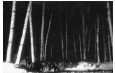
Still from my video "Black Spaces Between White Birch Trees."

The next day was the day of my screening of my video, but not until evening. I