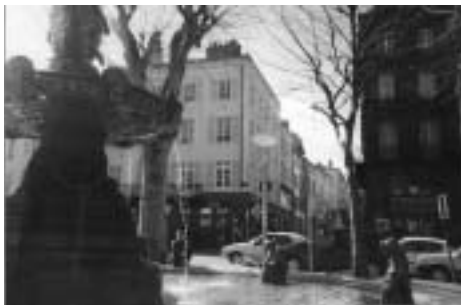
Steep narrow streets in Clermont-Ferrand.

In my favorite scene a train winds through the dusty growth near the forest at dusk. The train makes a loop curve, so we are looking back at people hanging listlessly from their windows in the golden heat.