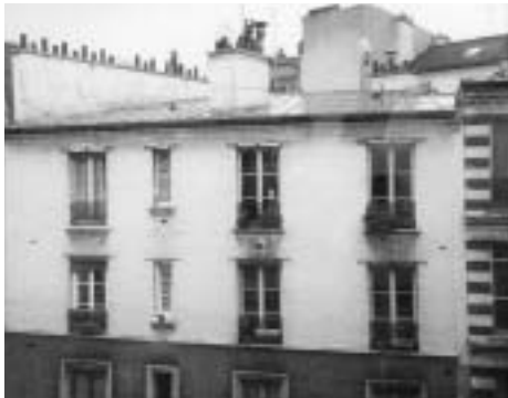
View from the apartment in Paris.