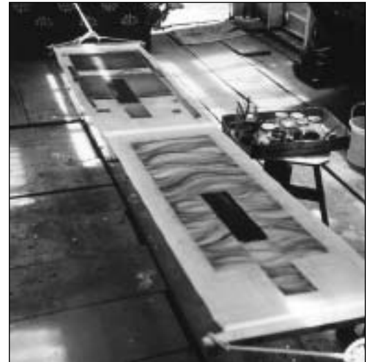
Studio-work in progress.