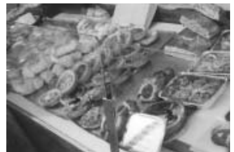
Food in an open air market in Paris.

Back at the theater I saw an excellent documentary about Africa by Christian