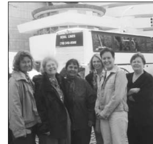
New York Bus Tour: Everyone enjoyed a gorgeous spring day in NYC. WCA members visited the Whitney Biennial, The Met and the Guggenheim. It was a wonderful and exhausting day!