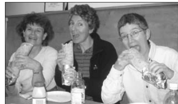
Portland Trip: WCA members and their friends braved the misty, cold rain to see galleries around Portland and to visit the Portland Museum of Art. Here they are enjoying "Giant Falafels" as they gather strength to continue their tour of Portland.

Please join us for a trip to Mass Moca! We will meet at noon in the museum cafe. First, we'll eat, and then we will spend the afternoon exploring the museum. There are free museum tours all afternoon, and they are really wonderful! If you have not been to Mass MoCA, here is your excuse to go. The museum is unlike any museum in New England. Their huge spaces allow for massive installations. In the Building 5 Gallery which is the size of a football field, you will see "Corpus" by Ann Hamilton. Hamilton has animated the space with sound, light and millions of sheets of paper that will fall from the ceiling over the course of the ten-month show. Who knows how deep the paper will be by July! Check out what else is going on at Mass MoCA by going to their website at www.massmoca.org .