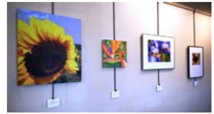
Flowers Interpreted at the Epsom Town Library.