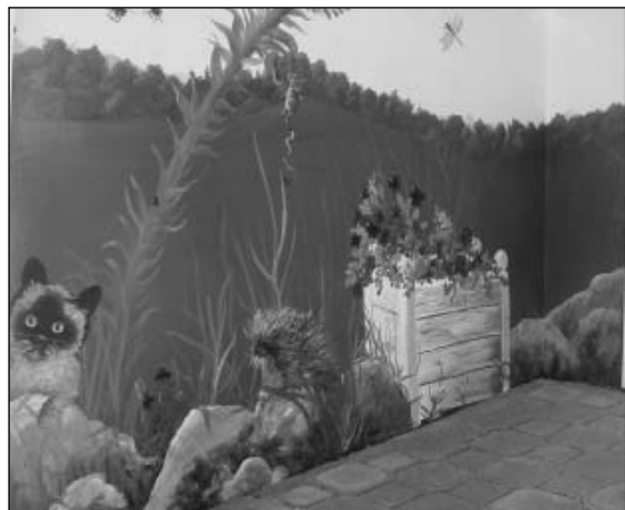
Top right: part of Mural at Wingdoodle in Warner. Bottom left: one Mural at First Baptist Church Bradford.