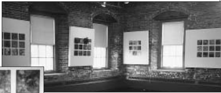
Scenes from the Six by Six show.