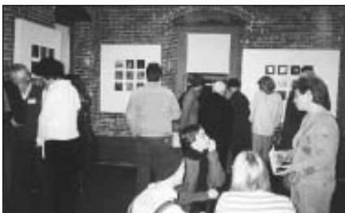
A scene from last year's 6x6 show opening reception.

We will be having a repeat of the very successful 6 x 6 Show at the Belknap Mill Gallery in Laconia, NH. The show will be held October 30 - November 28, 2003, and the Opening Reception will be held Thursday, October 30, 5:30-8:30 p.m. Drop off dates are October 27-28th, 9a.m.-5p.m. at the gallery. Entry fee for the show is $25 which includes 4 panels. The deadline to enter is Friday, September 12. If you sent your entry fee and have not picked up your panels, please arrange to pick them up by September 12.