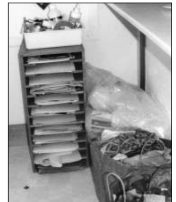
OLD MUSIC STAND/FILING SYSTEM