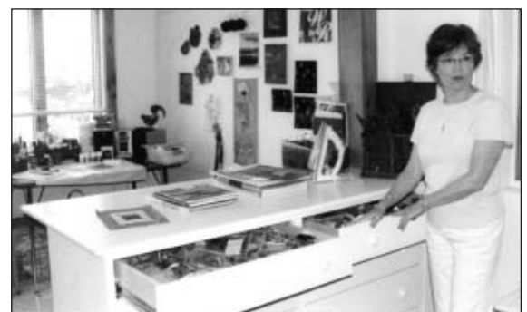
STORAGE DRAWERS/WORK SPACE