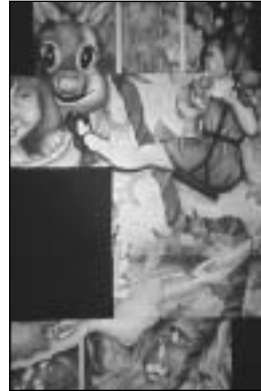
"The Four Seasons," mixed media